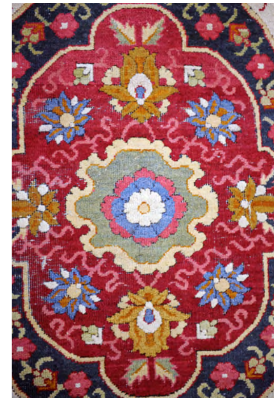
fig. 5 Detail of cartouche showing ton-sur-ton technique of the Trinitarias carpet . The cartouche is positioned to the lower left of the medallion

European provenance might provide another indication of place of manufacture. While in the later seventeenth and eighteenth centuries there is a substantial documentation of the import of Indian carpets into Europe (and also into Japan) through the Dutch East India Company, in the sixteenth and early seventeenth centuries the Portuguese were major players in the Indian trade, having set up communities on the west coast of India in the sixteenth century shortly after Vasco da Gama’s