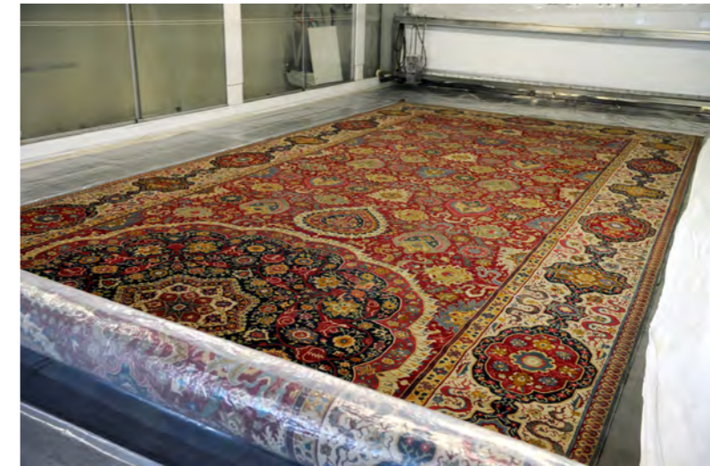
fig. 2 Lower section of the Trinitarias carpet prior to cleaning De Wit Laboratory, Mechelen, Belgium, 7 August 2010

The bottom half of the carpet (that including the end from which the weaving process began) was unrolled in the washing area when I arrived. Most of the analysis work was done on an accessible area half the length of the carpet on its lower left side, about a metre into its width (fig. 2). While this was not an ideal situation for carpet examination, because of the huge size of the carpet and the available space in the De Wit laboratories, it sufficed for a careful examination of almost a quarter of the carpet's entire fabric. A search in this area for jufti knotting (knotting over four rather than two warps) and irregular knot patterns (such as offset rows of knots), both of which would have contradicted an Indian provenance, produced nothing. A few spots of candle wax were noticed that had escaped the massive de-waxing operation undertaken in Melbourne before shipping the carpet to Belgium. The carpet was examined with a medium-power optical loupe, and 12MP RAW and JPG digital photographs were taken with a Nikon D3 camera equipped first with a 24–70mm zoom lens (for general views), and second with a 60mm micro lens (for close-ups). Additional 12MP JPG photographs were taken through the loupe itself with a Canon G9 digital camera. Measurements and observations for every aspect of the analysis were made in several different places along the half-length of the left side of the carpet; minor differences were averaged.