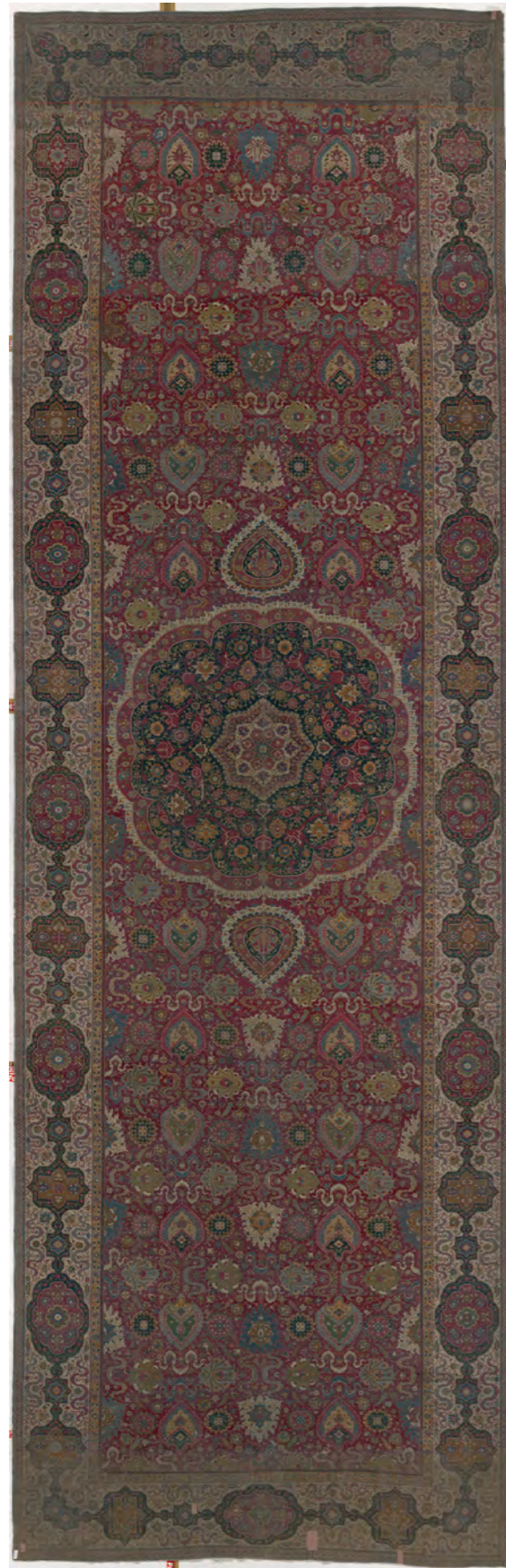
fig. 1 Mughal Trinitarias carpet early-mid 17th century wool pile, cotton warp and weft 1044.0 x 336.5 cm National Gallery of Victoria, Melbourne Felton Bequest, 1959 (91-D5)