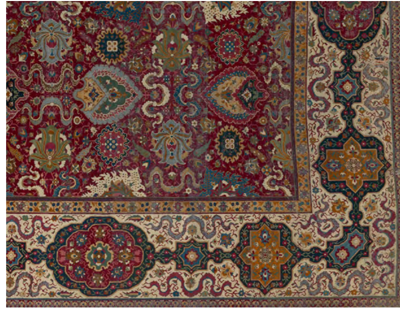
fig. 3 Lower section of the Trinitarias carpet showing corner resolutions within the major border

The main border of the carpet has a white ground ornamented with small floral palmettes and cloud bands; it is decorated with large oblong red-ground cartouches alternating with smaller eight-pointed ochre-ground medallions, these motifs linked in turn by even smaller eight-pointed light-blue-ground stars (fig. 3). The corner resolutions of the major border are arbitrary; the bottom border was planned from the centre outward beginning with a cartouche, resulting in ‘Siamese twin’ corner motifs based on the small light-blue-ground stars; at the top of the carpet, the weavers apparently ran out of loom before being able to finish the central field symmetrically; the corners consist of small improvised forms based on the large cartouches. This corner articulation strongly suggests again that the entire design was based not on a knot plan but on a paper cartoon, a fairly common occurrence in early carpets.