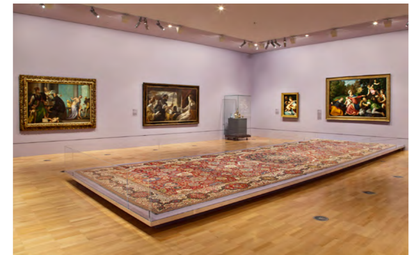
fig. 6 Trinitarias carpet on display in the 16th to 17th Century European Painting and Sculpture gallery, National Gallery of Victoria