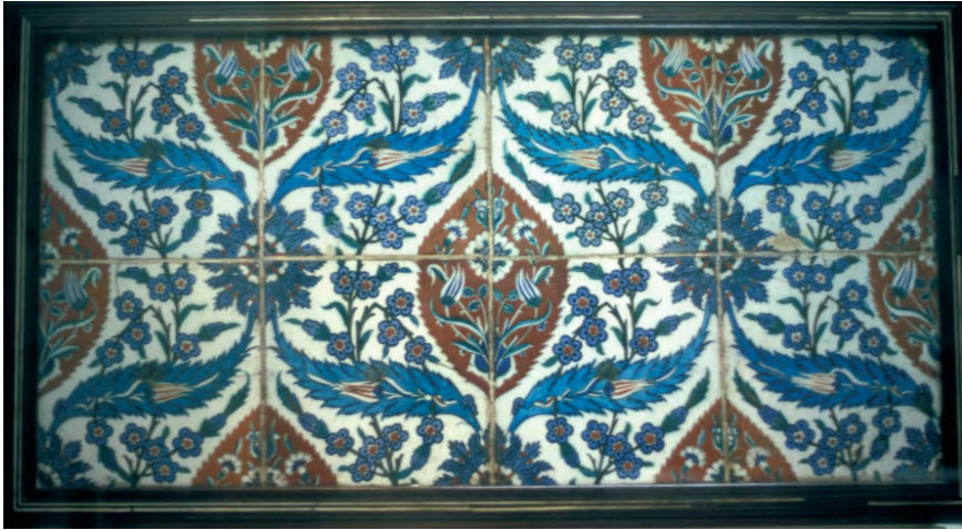
Illustration 13. Panel of eight tiles with quartered red-ground ogival medallions Musée du Louvre, Paris

ge quantity of tiles in the very same pattern. 14 Unlike the originals of ca. 1572, however, these later tiles were of a slightly lower technical quality; the white slip is slightly bluish, the green and pale blue are very thin, and the curved leaves bear a central decoration of overlapping white circles rather than the simple red spine of the 1572 production. It is to this group that the fourth Providence tile belongs. Similar examples are found in the Hetjens-Museum in Düsseldorf and a number of private collections; two belonging to Joseph V. McMullan of New York were on loan to Harvard University's Fogg Art Museum in the later nineteen-sixties. [Illustration 12]