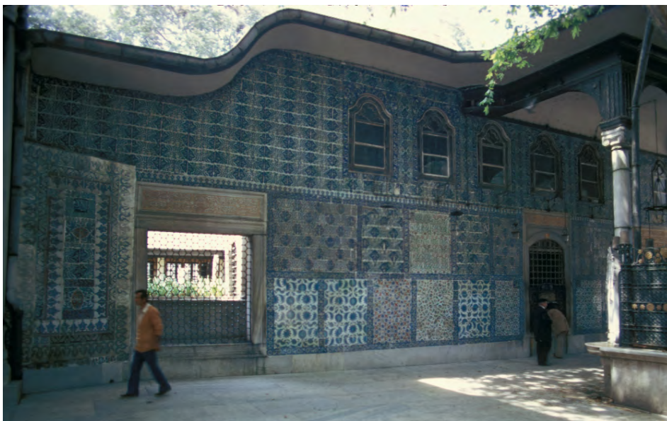
Illustration 14 Pastiche wall of tiles, probably assembled late 19th century Shrine of Eyüp Sultan, İstanbul