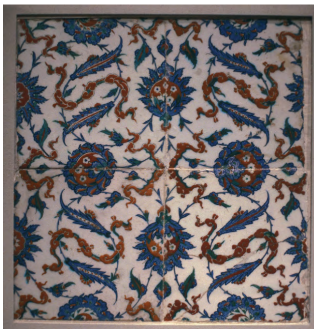
Illustration 11. Panel of four tiles with a red cloud-band and two leaves Al-Sabah Collection, National Museum, Kuwait