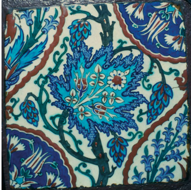
Illustration 1. Tile with a central grape leaf design Providence Art Club

The popularity of İznik tiles in the West, manifested in a major collecting phenomenon in the latter part of the 19 th century, has led to their widespread dispersal into a number of unlikely places. For example, the Providence Art Club in Providence, Rhode Island, a private organization founded in 1880, now occupies late eighteenth-century premises in that city that comprise, among other things, a capacious Central Dining Room. The present dining space was designed during a major renovation in the early 1940s, at which time the daughter of the renovation architect presented to the Art Club six İznik tiles, now set into the booth walls of the restaurant, where diners may examine them closely while eating. Three of these tiles are from the great age of İznik production in the 16 th century, and three were made in İznik in the 17 th . The three earlier tiles and one later tile are of the repeating-pattern type; and all are of types known from examples in other collections. [Illustrations 1-4] The fifth tile, a piece of a late unified-field panel, and the sixth, a border tile from the 17 th century, will not be discussed here.