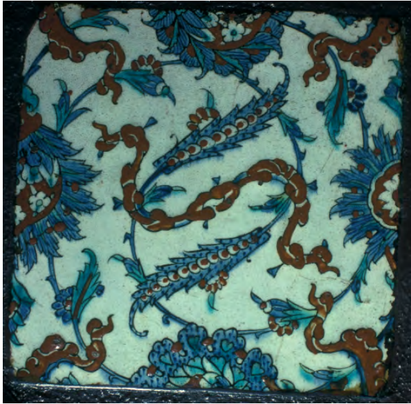
Illustration 4. Tile with a red cloud-band and two leaves Providence Art Club

upled with the very dark true green, suggest that this tile comes from the mid-1560s; stylistically and in the particular hue of green, their closest parallels found in situ in Turkey are in the tomb of Süleyman I, completed in the garden behind that sovereign's mosque in İstanbul around 1566. 6 Identical tiles are found in a panel of six formerly in the Musée des Arts Décoratifs, Paris; another panel of six (with one slightly cut down), formerly in East Berlin, is now in the reunited Berlin Museum für Islamische Kunst. [Illustration 6] A third panel of six, combined with border tiles of diverse provenances, is in the Louvre (3919/2-254). A number of identical tiles, added to the building at some later time, are found in the library of the Aya Sofya mosque in İstanbul. Finally, an individual example is found in the Calouste Sarkis Gulbenkian Museum in Lisbon. 7