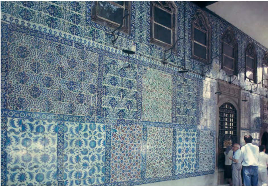
Illustration 18. South wall of Shrine of Eyüp Sultan, İstanbul, with two different blue-ground tile borders