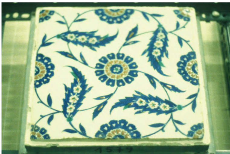
Illustration 8. Tile with a central rosette and four leaves Calouste Sarkis Gulbenkian Museum, Lisbon, Inv. 1579