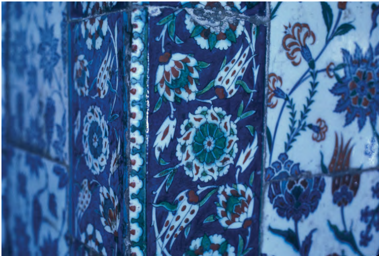
Illustration 19. Blue-ground tile border with two white tulips and rosettes Detail, east rear balcony, Mosque of Sultan Ahmet I, İstanbul