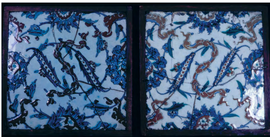
Illustration 12. Two tiles with a red cloud-band and two leaves, ca. 1600 – 1625 Formerly collection of Joseph V. McMullan