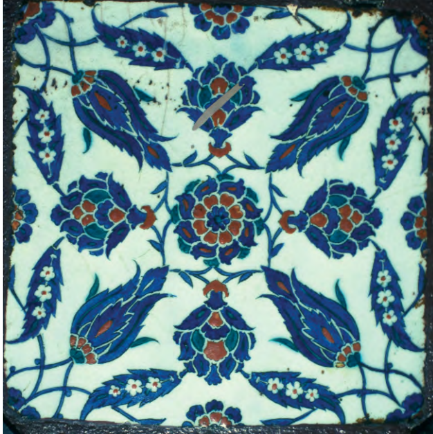
Illustration 2. Tile with a four-fold tulip design Providence Art Club

The first of these tiles [Illustration 1], depicting a large grape leaf on an undulating vine with quartered floral roundels and ogival medallions in the corners, was previously published by the author. 3 Probably a product of the Āznik kilns in the 1570s or 80s, it is of an unusual pattern in which four tiles, greatly similar to each other, form the repeating unit. The easily indentifiable grape leaf, ornamented by a tiny white flower and two rosebuds, is accompanied clusters of immature grapes on the vine. Red tulips and blue hyacinths ornament the quartered ogival medallions, and white tulips and carnations are found on a blue ground in the quartered cusped roundels. This sophisticated composition is further unusual in that in addition to employing the full palette developed in Āznik by the early 1570s, including two values of blue, turquoise, red, and a dark green together with a black outlining, it uses the black color not only as outlining, but as a field color in the thick stems of the vine. Another example, slightly cut down, is in the Isabella Stewart Gardner Museum in Boston, yet another is in the Museum für Angewandte Kunst, Vienna, [Illustration 5] and a panel of 16 such tiles, from an American private collection, was sold in April of 1988 at Sotheby's in London. 4 Tiles in this