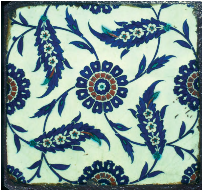
Illustration 3. Tile with a central rosette and four leaves Providence Art Club

pattern are quite rare and are not widely known in Western collections; the author originally conjectured that they were made in limited quantities for a secular setting, possibly a private residence.