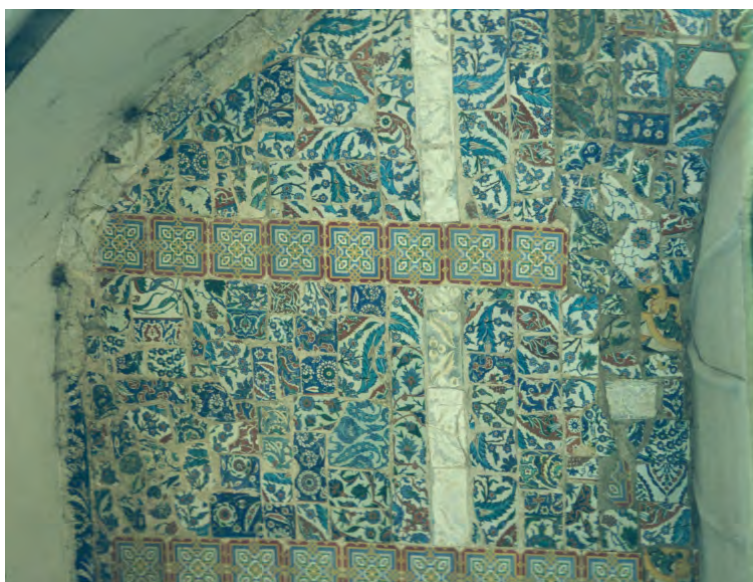
Illustration 15. Pastiche wall of tile shards, probably assembled late 19th century Shrine of Eyüp Sultan, İstanbul