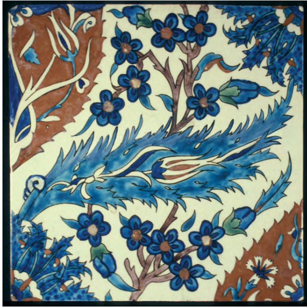
Illustration 16. Reproduction of an Iznik tile with quartered red-ground ogival medallions. Probably 20th century; private collection

Is there any way of dating these tiles accurately? Is there any way that we might be able to determine an original site for this large number of tiles? Is there a border that might be associated with these repeating field tiles? In this paper I would like to propose possible answers to all three of these questions. To do so, we first need to look carefully at the tiles themselves. They are of four different patterns, two being a mirror image of the other two, creating a repeating pattern encompassing four tiles, with a definite top and bottom. [Illustration 13] The pattern of each is composed of a central curved turquoise leaf decorated with a red-and-white tulip, against a background of branches of a flowering prunus tree with a thick black stems. In two opposite corners of each tile there is a quartered deeply serrated palmette in light blue stippled with dark blue, and in the other two corners there is a portion – either slightly more or slightly less than a quarter – of a red-ground ogival medallion with a design in reserve white of a caliper from which spring two white tulips, two white carnations, a group of small leaves, and a white rosette. The major motif of the pattern – the ogival medallion – is thus never complete on a single tile, but rather is formed at the juncture of four tiles. The primary motif on each