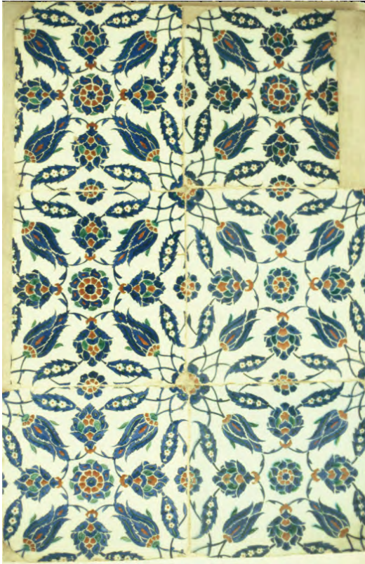
Illustration 6. Panel of six tiles with a four-fold tulip design Museum für Islamische Kunst, Berlin

ce (on the present site of İstanbul University) or the Topkapı Palace to the east rear gallery of the mosque of Sultan Ahmet I around 1616, part of a major plundering of sixteenth-century tiles from existing monuments that took place in order to decorate that immense structure. 12 [Illustration 10] Others ended up in a number of museums around the world, including the Louvre, the Brooklyn Museum, the National Museum of Kuwait, [Illustration 11] the Benaki Museum, the Museum für Islamische Keramik und Fliesen in Tegernsee and the Çinili Köşk Tile Museum in İstanbul; a panel of six was sold at Sotheby's London as recently as October of 2004. 13 For whatever reason, for a subsequent redecorating of the Topkapı accomplished about thirty years later around 1600, it was decided to have the İznik ateliers produce another lar-