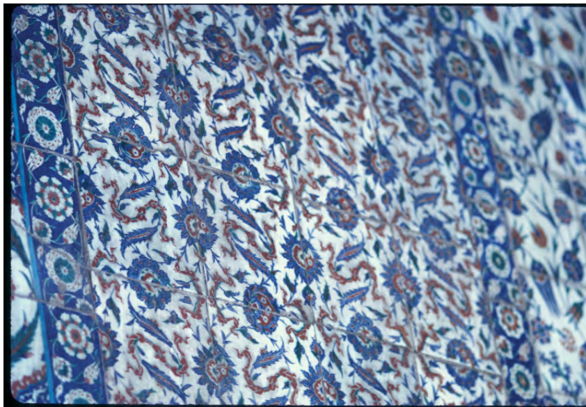
Illustration 10. Wall of tiles with a red cloud-band and two leaves Detail, east rear balcony, mosque of Ahmet I, Istanbul