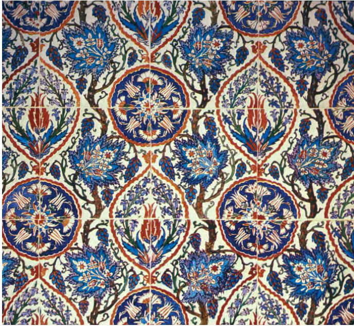
Illustration 5. Field of tiles with grape leaf designs Formerly in a private collection, United States

is surrounded by four blue leaves decorated with white flowers, arranged in a rotating pattern around the central motif, a popular Ottoman tile layout. The decoration is completed by halved rosettes at the middle of each edge. A single tile in this pattern is known from museum collections; it is in the Gulbenkian Museum in Lisbon. 9 [Illustration 8]