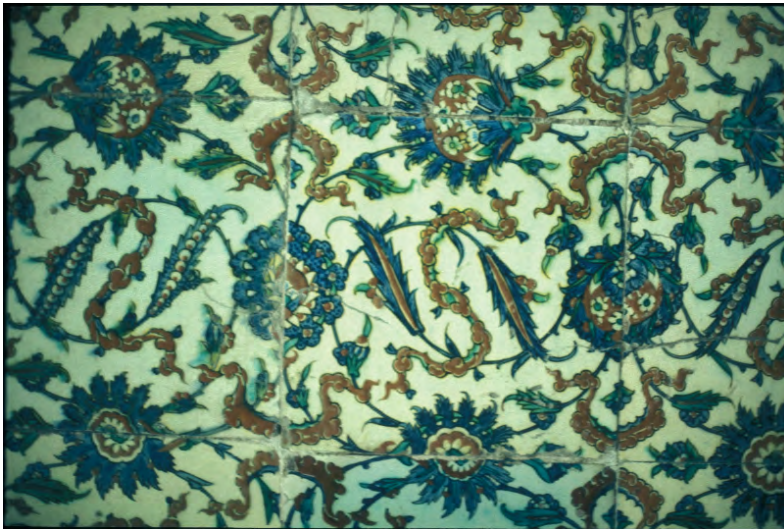
Illustration 9. Wall of tiles with a red cloud-band and two leaves Detail, interior of the Murad III room, Harem, Topkapı Palace Museum, Istanbul